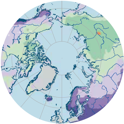
Projected change in mean annual SCD from 1970-1999 to 2049-2060, %