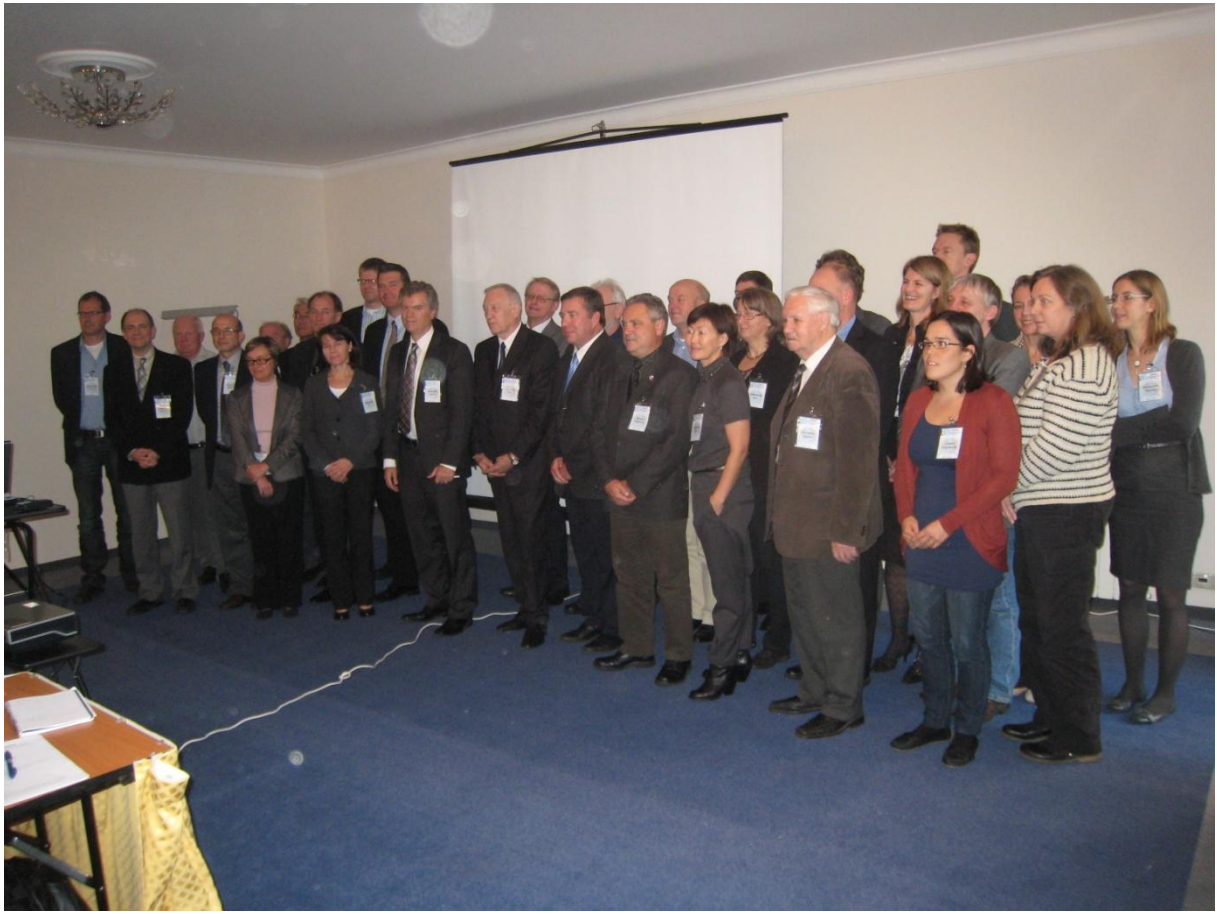
AMAP WG 25 Meeting Participants.