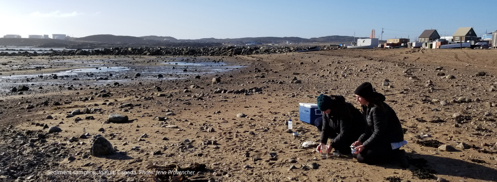
Sediment sampling, Iqaluit, Canada.